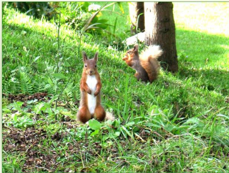
Squirrels at Kippford