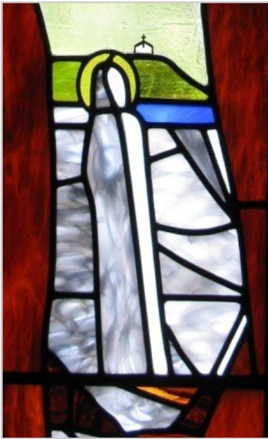
Detail from the St Ninian window

is turning away from a period of contemplation in the cave towards his ministry in the world, his gaze fixed on his Church.