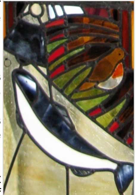
Detail from the St Kentigern window

The branch symbolises an occasion at Culross when the fire went out for want of dry wood. Kentigern cut down green branches, from which he re-lit the fire.